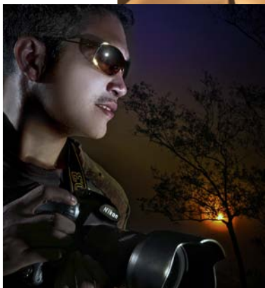
Manual Librodo International Photographer